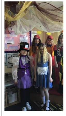
There was a particularly strong showing of Alice in Wonderland characters in Year 6

What wonderful book characters came into school on Thursday. Thank you to all parents for the hard work in creating such exciting costumes. Here are a few snap shots from the day.