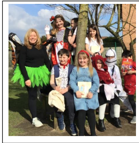
Year 3 spent the day with a beautiful butterfly and one of several Wallys from the very popular 'Where's Wally' series.