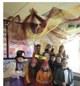
Year 6 Bedouin Tent

These areas are already being enjoyed by the children. Part two to add a hot air balloon to Year 3 and a Safari hut to year 5 will take place soon- check future newsletters for dates and details.