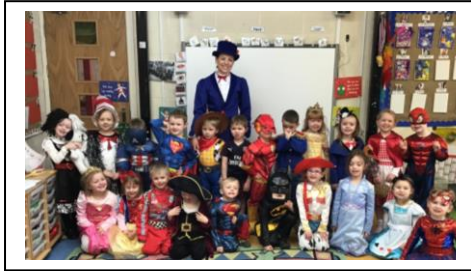
Little Owls were looked after by a practically perfect Mary Poppins.