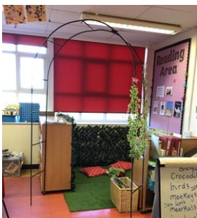
Year 1 Woodland

Another thank you to all the parents who came into school on Saturday 29.02.20 to help create some of our reading areas in classrooms.