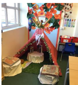
Year 2 Tee-pee