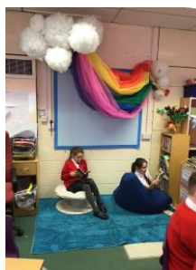
Year 4 Up in the clouds