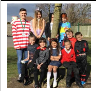
Another Alice in Wonderland made sure all the characters in Year 1 shared their favourite books.